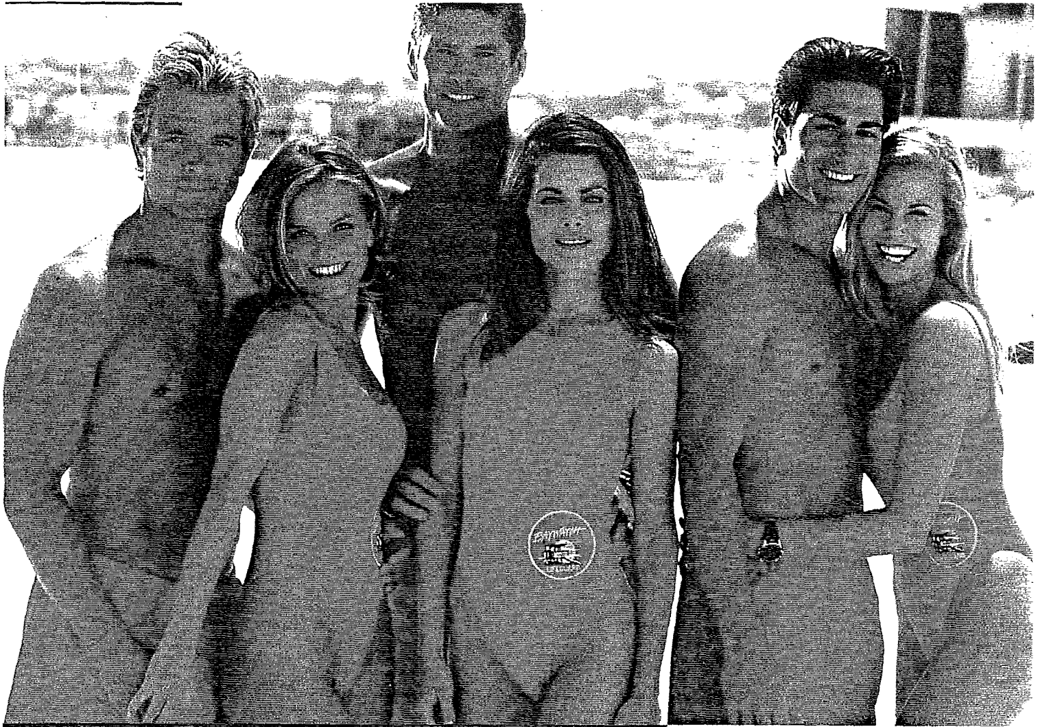
The cast of BAYWATCH